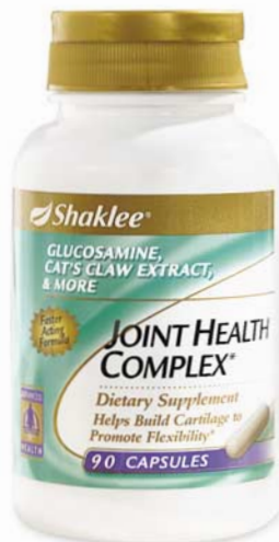
Joint Health Complex* 90 capsules #20668

Joint Health Complex improves the cushioning in joints for more comfortable movement, flexibility, and range of motion. Plus, the complementary blend of glucosamine, cat's claw, and specific trace minerals supports overall joint function, enhances mobility by supporting joint lubrication, and helps your body build cartilage.*